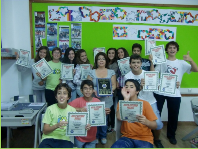
Killer Asteroid Project